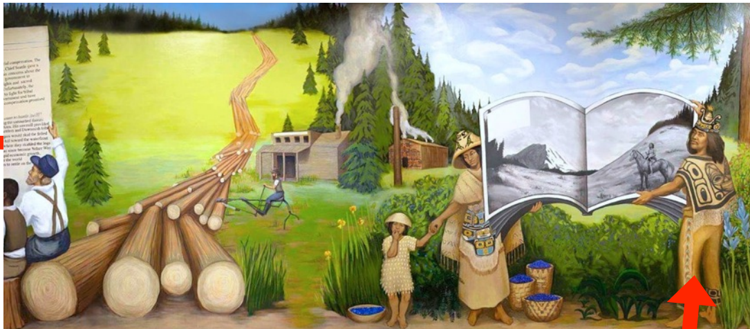
Mural by Gabrielle Abbott, © 2013. Dimensions: 12' x 285'